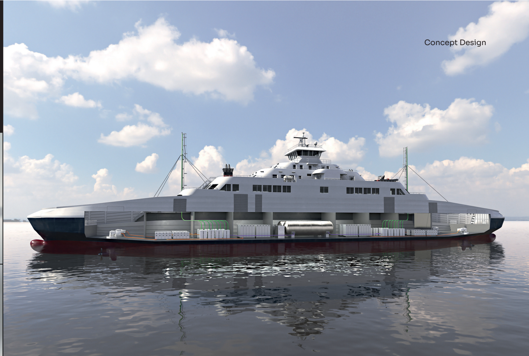
Image explanation from left to right; Electric podsystem, Energy management system, Fuel cell system, Battery storage, Hydrogen storage